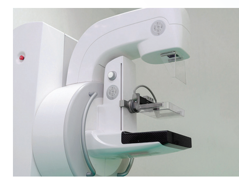
Lead-Lined Tube Housing Assemblies

Our customers rely on us for aerospace engine and exhaust components, rotor blade and missile components, and x-ray tube components and housing assemblies. Leveraging the expertise of Connecticut Coining, Gasser and GAR Electroforming, AMG helps customers navigate their most difficult manufacturing challenges and knows how to deliver products that meet their stringent requirements.