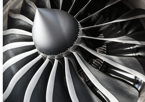
Rotorcraft Blade & Turbine Engine Abrasion Guards