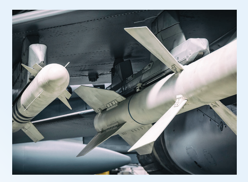
Missile Body Skins, Nose Cones & Wing Slot Seals (heat shields)