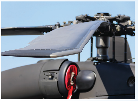
Rotorcraft Blades Leading Edge Abrasion Guards