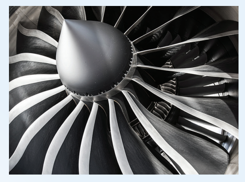
Turbine Engine Guide Vane Abrasion Guards